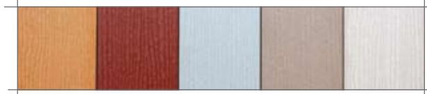
Cedar, Redwood, Light Grey, Weathered Wood and Sand. (Actual colors may appear different; please select from product samples)